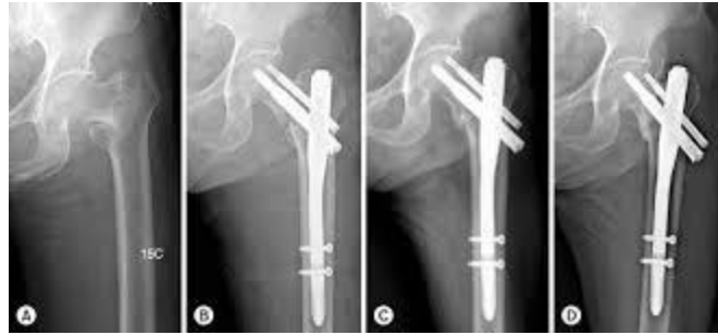
Figure 1: Intertrochanteric fracture with PFN