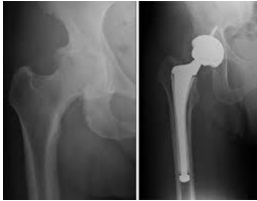
Figure 3: Total hip replacement

meta-analysis showing that compared with HA, THA has a lower long-term risk of re-operation rates at 13 years post-operatively but not mortality. However, the rate of dislocation was higher in the THA group (17.2% versus 4.5%). Similar findings were reported by Hopley et al. in their systematic review of 1890 patients more than 60 years old; the authors cited a 4.4% risk of reoperation difference in THA compared with HA as well as better Harris Hip Score (HHS) ratings up to 4 years postoperatively[32]. Several other meta-analyses concur with these findings, although there are inherent limitations in using the HHS for evaluation[33]–[34].