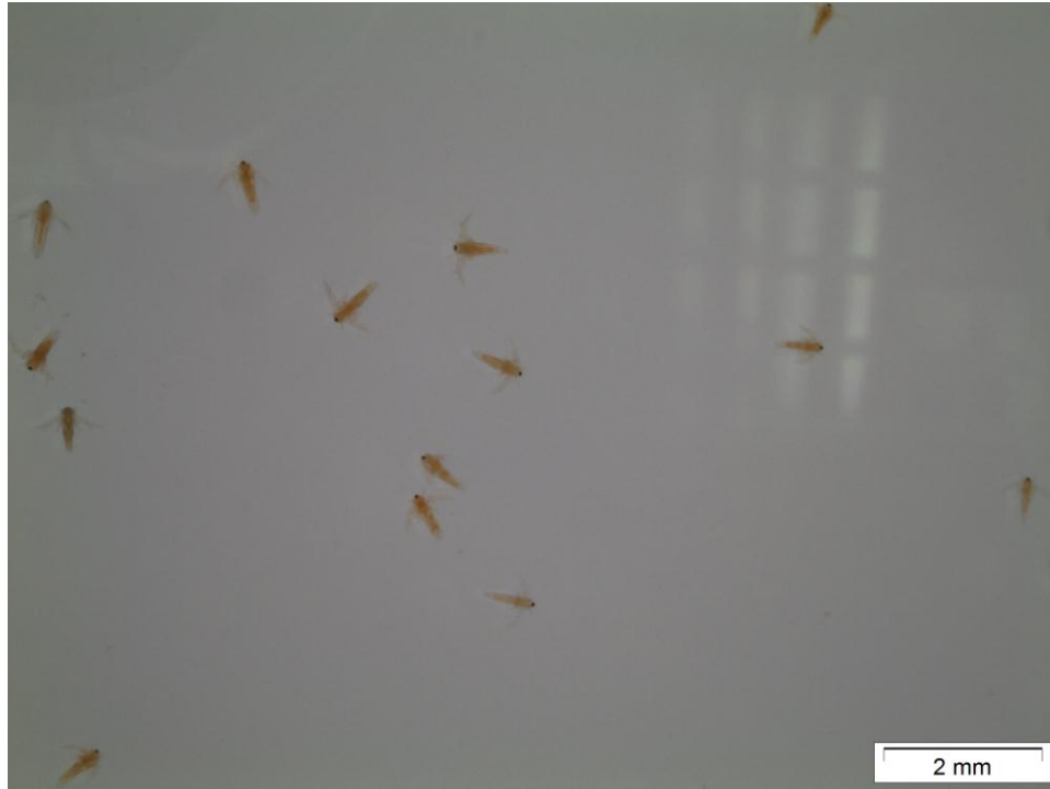
Figure 1: Instar II brine shrimp nauplii

To facilitate the rapid execution of this test, the final volume was set in 1.5 ml (Figure 2). About 30 nauplii (instar II) in 0.5 ml sterile natural seawater was mixed with 1.0 ml bacterial suspension ( \sim 10^7 CFU/ml). The test was conducted for 24 hours for rapid observation. All test were conducted in three independent replicates and repeated trice. The data were statistically analyzed using the t-test (two-sample assuming equal variances) of MS Office Excel (Microsoft, Redmond, WA). The result was considered significant if the p -value was lower than 0.05 [8].