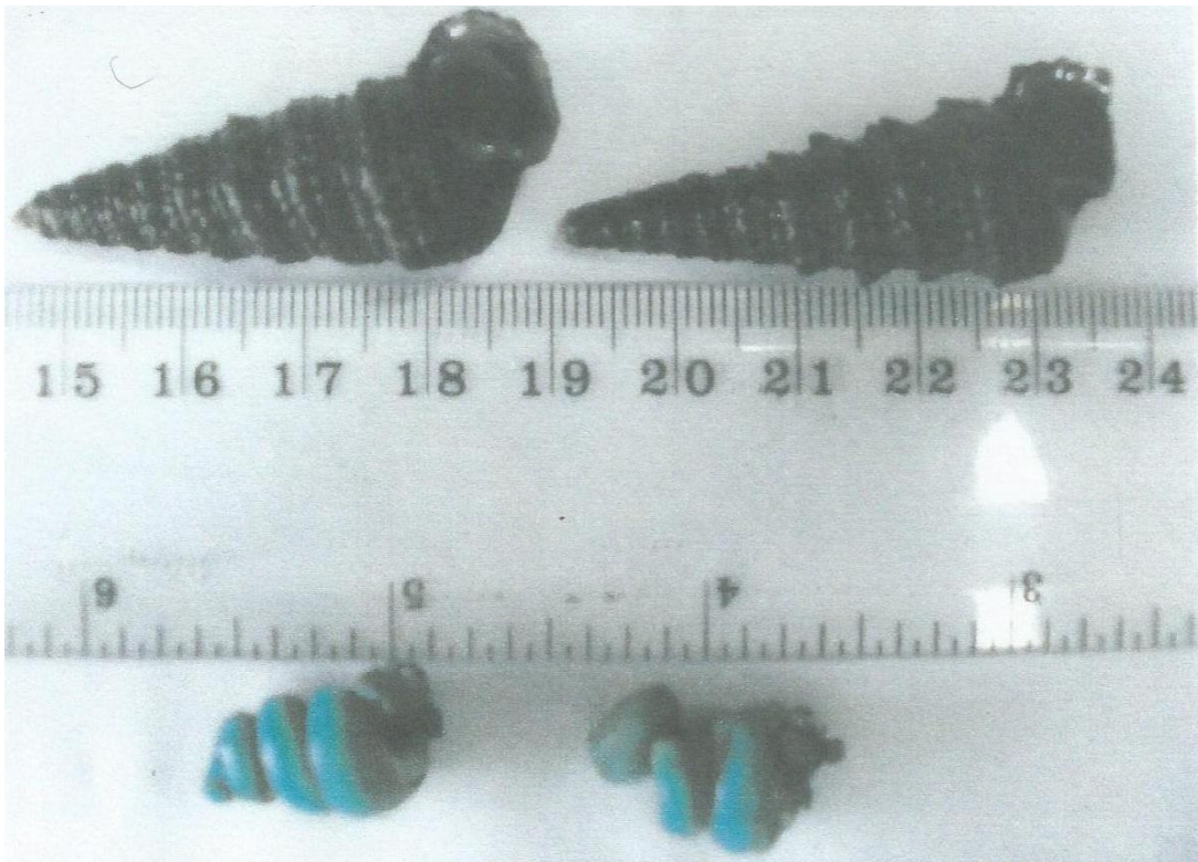
Figure 1: Tympanotonus fuscatus from the study Area