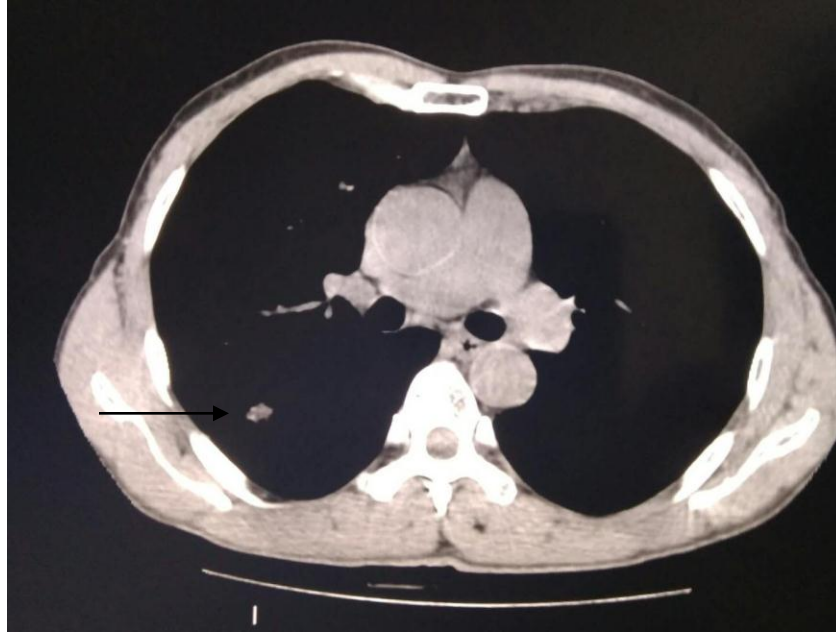
Figure 1: Chest axial CT in lung window setting showing ill-defined nodule with ground glass appearance on right upper lung.

Informed consent for the resection of the mass was taken from the patient. Then, Thoracoscopic assisted resection of the upper and lower lobe of the right lung was done. The size of the mass was found to be about 1.0*1.0cm and was lying between the upper and middle lobe of the right lung. So, partial resection of upper lobe and lower lobe mass was done. The specimen was sent for histopathology which confirmed the mass to be benign. During surgery 1500ml blood loss, blood transfusion 600ml was done, no blood transfusion reaction, the operation was successful and patient was shifted in postoperative recovery room.