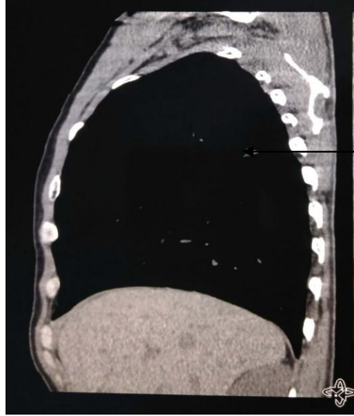
Figure 3: Sagittal view of chest CT showing ill-defined nodule with ground glass appearance in the posterior lower part of upper lobe of right lung.

Post-operative pathological diagnosis was (right upper) pulmonary cavernous hemangioma.