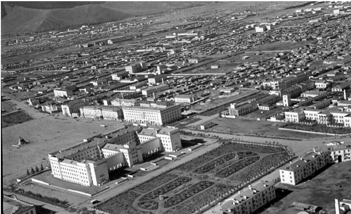
Figure 6: Ulaanbaatar (1950s)

In the 1940s, they have faced some problems for urban redevelopment, the establishment of land, identification of activities, estimation of city streets and the size of roads, planning of buildings, hospitals, culture, and trade facilities. Also, clarifying forms of construction; also, irrigation of urban areas, environmental and green housing, eco-friendly housing, clean water supply for residents, was needed for proper calculation of sewage and heating systems. At that time, large buildings such as the National University of Mongolia (1943), the Government House (1945), the Opera House Theater (1947) and Eldev-Ochir's Theatrical Theater (1947) were formally constructed to the main square, making them part of the city center.