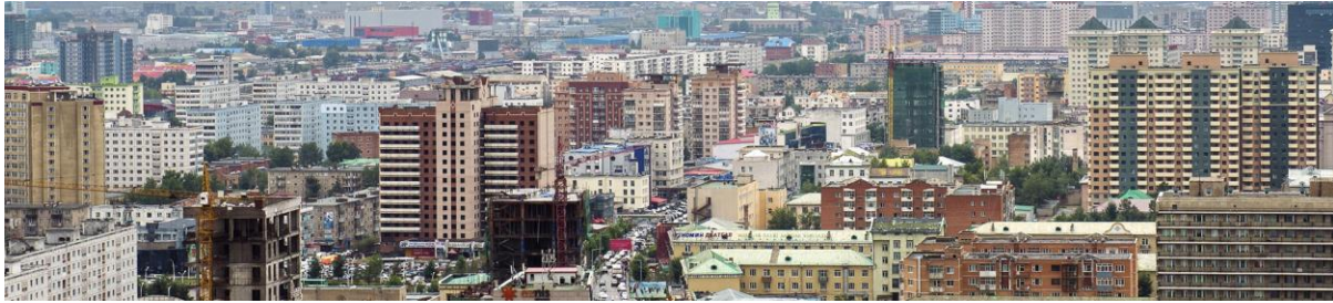
Figure 7: Ulaanbaatar (2000)

district planning 9 and 12-story tower-shaped apartment buildings and housing to direct pedestrian and auto traffic and a peaceful environment among the residential space surrounding the closure of noise pollution residential buildings, opportunity. By the time of the fourth general plan in 1986, the total area of the city was 9864 hectares. It has been estimated to reach 850 thousand of the population. Ulaanbaatar, the capital framework so was the peak widened and expanded, punched spatial planning, city center to determine the country of Mongolian and bloom.