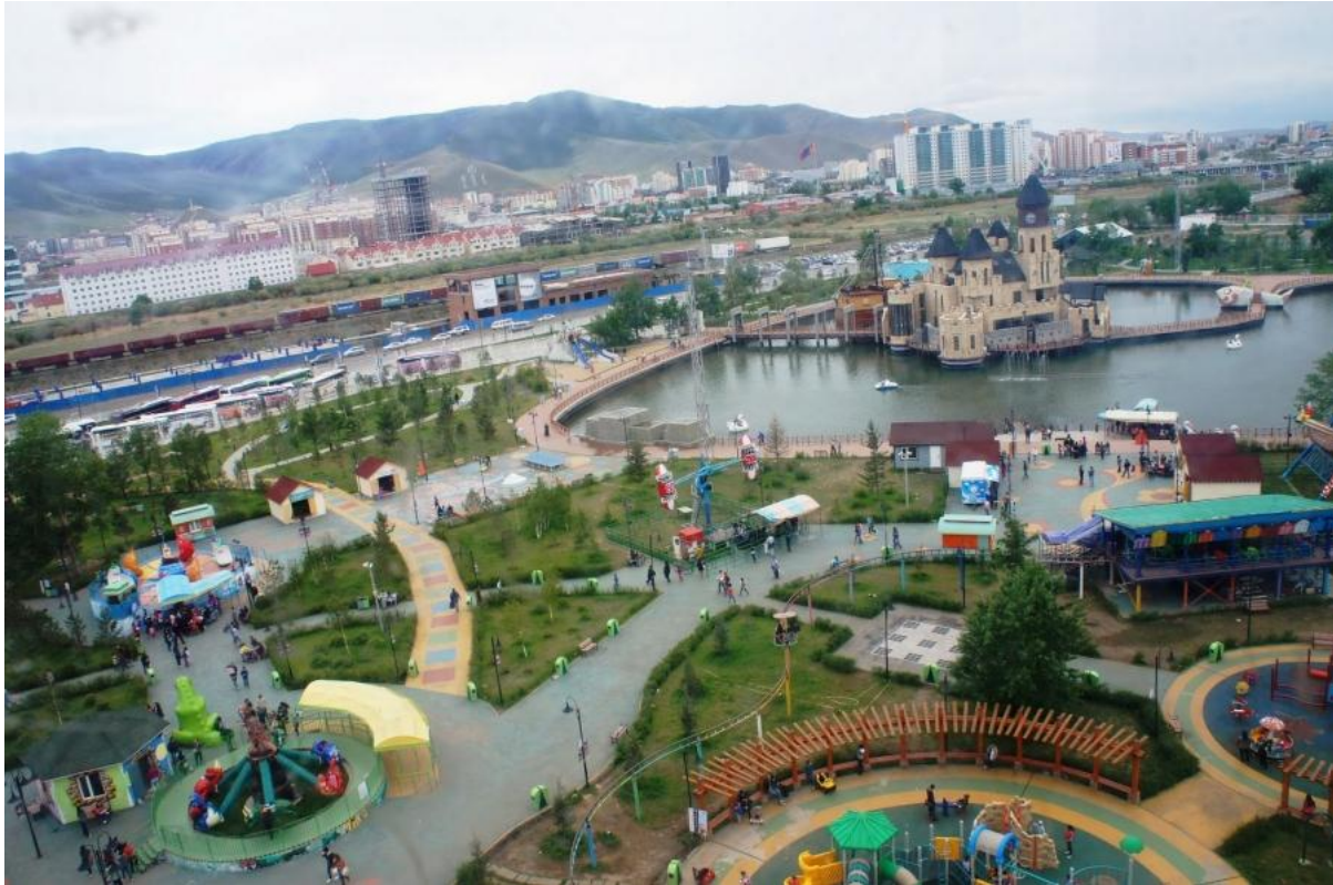
Figure 10: Amusement Park in Ulaanbaatar

originally owned by the State. In 2005, the 35-hectare site was privately owned by private companies and municipalities. Of that, 32 hectares of area are planned for re-planning by Bodi group and 12 hectares of parks are still open to the Children's Park and plans to construct hotels and confined buildings in the rest of the area. The reducing area of the Children's Park has been heavily opposed by citizens.