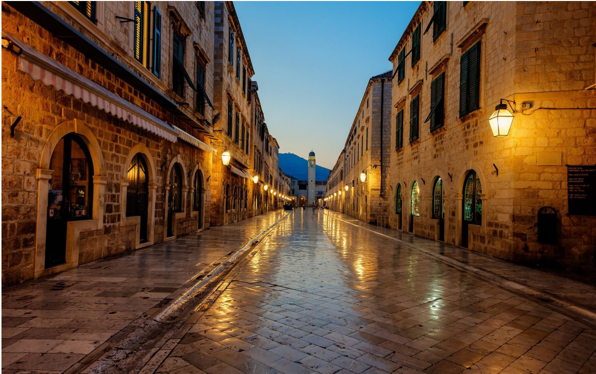
Figure 2: Example of Street (Sienna, Italy)

gatherings. Street-based construction and land use depend on how the road planned. Therefore, Street space has a significant impact on the urban structure, surface partitioning, and land use. In the formation of this social fabric, the streets are the main component of the city's necessary outdoor space and urban structure. There are two essential characteristics of the street related to the form: it is both road and area at the same time.