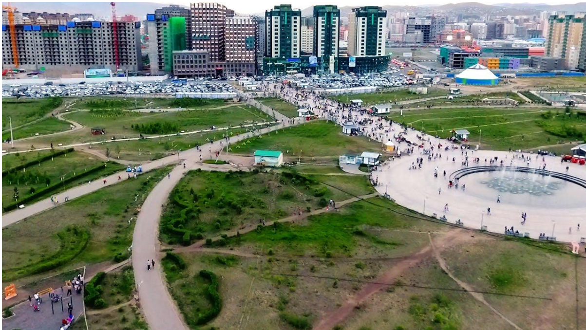
Figure 11: National Park in Ulaanbaatar

The National Park organizes the "Public Tree Planting Day" in May and October for the purpose of protecting the source of drinking water of the Tuul River in Ulaanbataar, reducing air pollution and creating a healthy ecological environment. Currently, more than 110,000 trees are planted and 28,5 hectares are greened and 183 hectares are green. This represents 23 percent of the city's green area. According to this, national parks represent a significant proportion of the green area of the city. However, this data is different from the current situation of the general plan. According to the 2030 general plan, by 2020, the total area of Ulaanbaatar's green area is 231.52 ha / table.