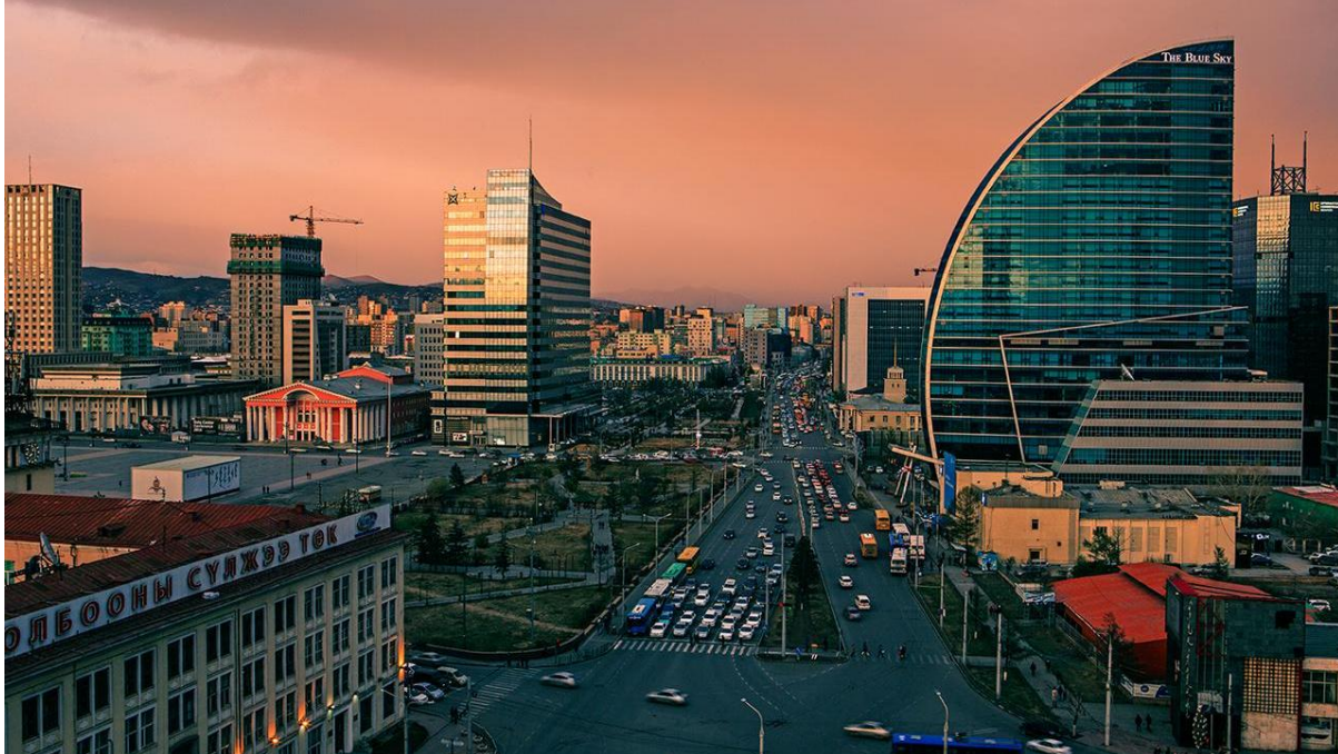
Figure 8: Street of Ulaanbaatar

In Ulaanbaatar, road construction and road network have been developing in general plan. The first Road Master Plan was made in 1999. However, the general plan reports say that there is no such data or information on the quality of the road and road traffic records and roads. According to a survey carried out by the Capital Road Authority, there are 132.3 km of major roads in Ulaanbaatar, 216.6 km of assist roads and 280.9 km of region roads in Ulaanbaatar. This figure shows that the path on the assist and the roads in the neighborhood are the same.