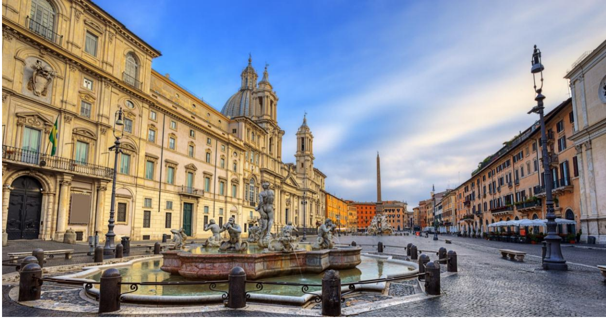
Figure 3: Example of Square (Piazza Navona, Rome)

The squares have been a social expression since ancient times. The square planning based on long-term historical experience, shape, purpose, and significance of the squares. The poorly planned square breaks the image of the city as a sting and a blind eye. But a well-planned square is itself an artwork. To design a wide-ranging square, we must first analyze the modern-day demands of the city's social, political, cultural and economic structures. It is also vital to involve future users in the square planning process.