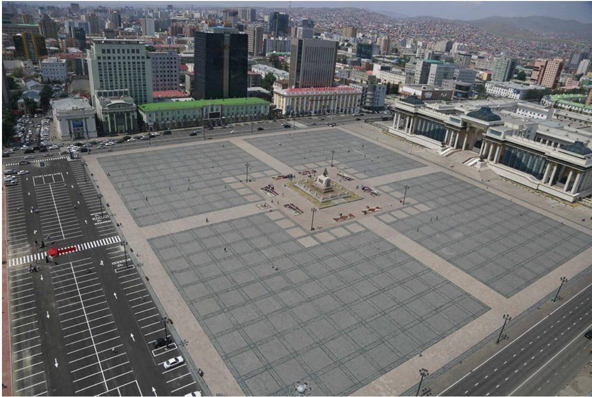
Figure 9: Sukhbaatar Square of Ulaanbaatar