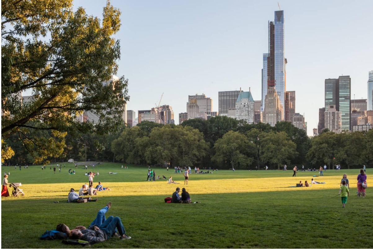
Figure 4: Example of Public Green Space (Central Park, New York)

Over the centuries, urban landscape has vast space, and there is no specific green area within the city. Today, unrestricted settlements are linked to the urban landscape, settlement areas, and landscapes. Thus the external space dominated by landscapes has already become an interior space. At the time of our time, the gardens and landscapes of the city have become of new significance. For cities, parks and green spaces are not cities. Anyway, it's not a city that is walking alongside time. Because of no other free space of any city, any area, no wooded streets, and any passage cannot compensate for the green space.